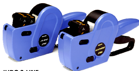
JUDO 2-LINE LABELLER